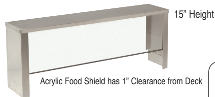
Single Sided Cafeteria Shelf with Built-In Food Shield

Acrylic Side Panels for Buffet Shelf Add side panels to meet additional NSF requirements (2 panels per end) TBP-1 One End TBP-2 Two Ends Field Installation Available