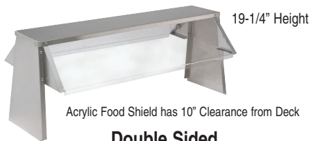
Double Sided Self-Serve Buffet Shelf with Built-In Food Shield

Visit our website for additional accessories